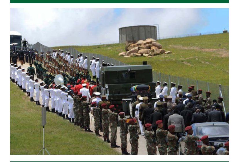
South African National Defence Force (SANDF) Soldiers in Salute