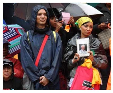
Mourners listen attentively during the memorial